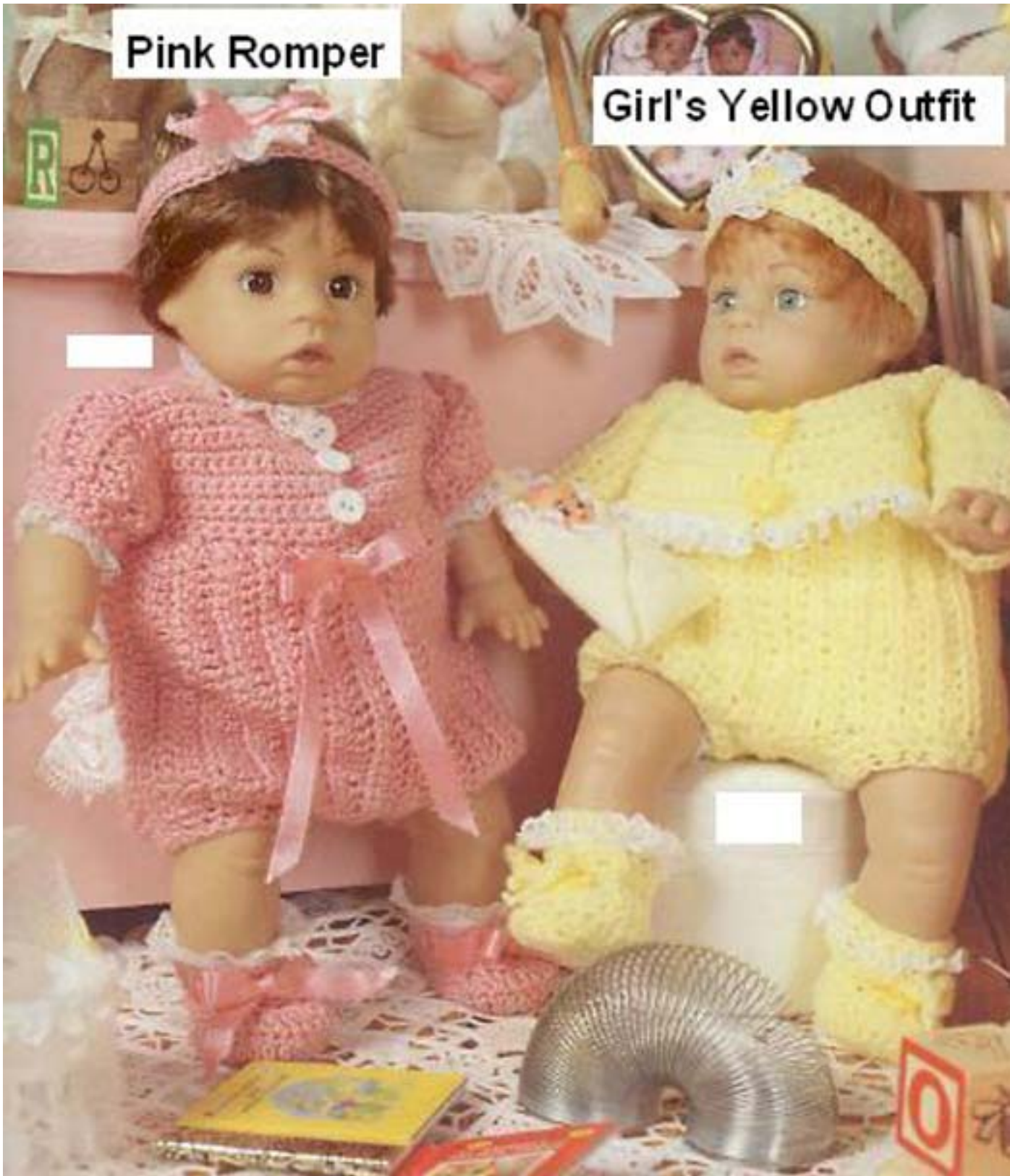
Girl's Yellow Outfit